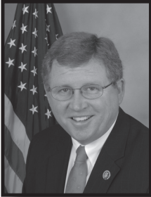
U.S. Representative Frank Lucas R-3rd District (invited)