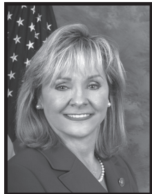
U.S. Representative Mary Fallin R-5th District